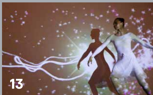
13 Jezuitski trg / Jesuit Square Buđenje / Awakening

Budi slika u slici / Become a picture inside a picture