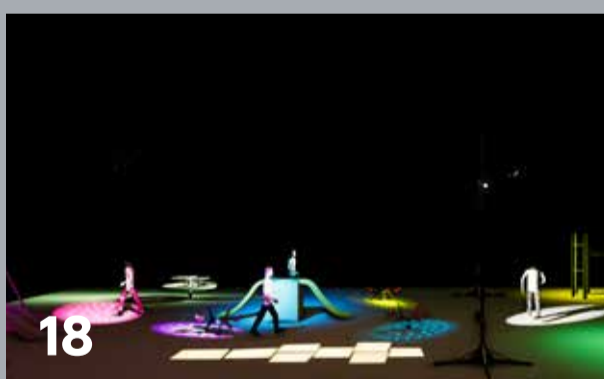
18 Dječje igralište – Dubravkin put / Children's Playground – Dubravkin Put Igralište iz snova / Dream Playground

Svjetlo cvijeća u mračnoj šumi / The light of flowers in a dark forest