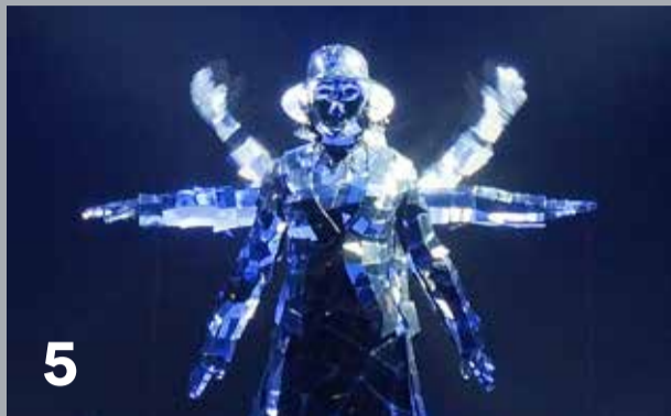
5 Strossmayerovo šetalište istok / Strossmayer Promenade east Lounge svjetla / Light Lounge

Svjetlosne animacije s Kule Lotrščak pozivaju na Festival svjetla. / Light animations from Lotrščak Tower invite you to the Festival of Lights.