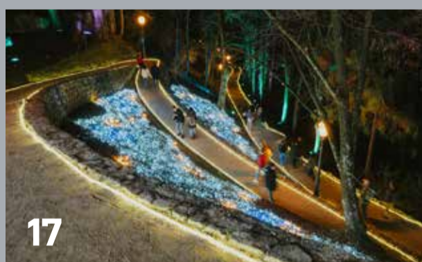
17 Vrazovo šetalište / Vraz Promenade Proletnice / Spring Flowers

Mijena svjetlosti od izlaska do zalaska sunca / The change of lights from sunrise to sunset