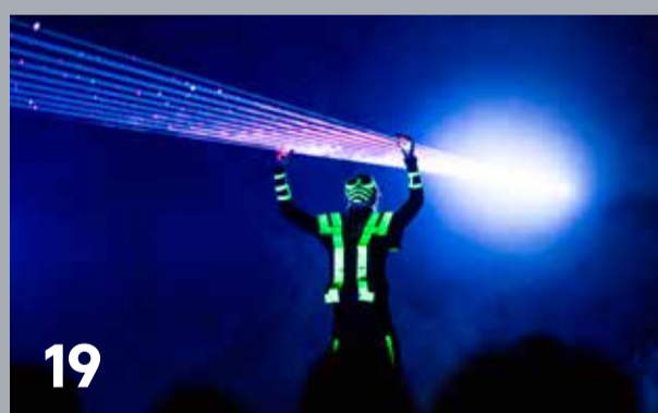
19 Ljetna pozornica Tuškanac / Tuškanac Summer Stage Laserski show / Laser Show

Odaberite svoje boje i igrajte se u parku snova. / Choose your colours and play in the dream playground.