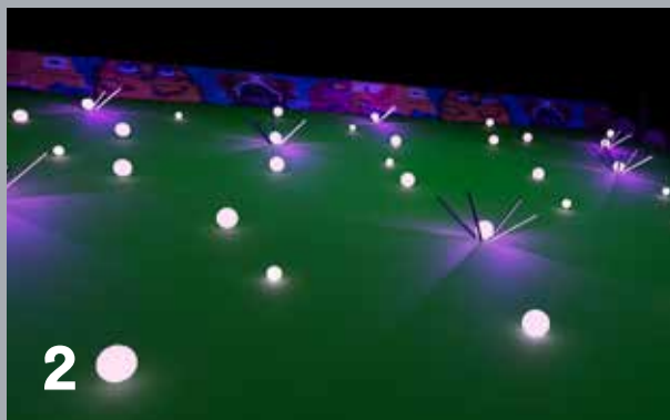
2 Art park Rosa i cvijeće / Dew and Flowers

Tunel ispod Zagreba postaje slikarsko platno transformirano u čaroban šumski svijet u kojem žive neobične životinje i rastu svjetleće biljke. / The tunnel under Zagreb becomes an art canvas transformed into a magical forest world where unusual animals live and luminous plants grow.