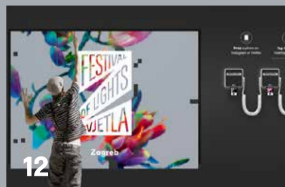
12 Galerija Klovićevi dvori / Klovićevi Dvori Gallery #Wall

Zaplešite u bojama proljeća / Dance in the colours of spring