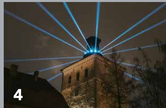
4 Kula Lotrščak / Lotrščak Tower Svjetionik / Lighthouse

Slijedite čuvare do ostalih svjetlosnih atrakcija Gornjega grada. / Follow the guardians to other light attractions in the Upper Town.