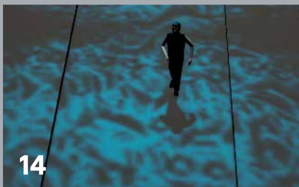
14 Opatička ulica / Opatička Street Aquastreet

Plesni performans i 3D mapping projekcija prizvat će dobri duh proljeća. / Dance performance and 3D mapping projection will summon the spirit of spring. Termini / Schedule: 18:45, 19:15, 19:45, 20:15, 20:45, 21:15, 21:45, 22:15, 22:45