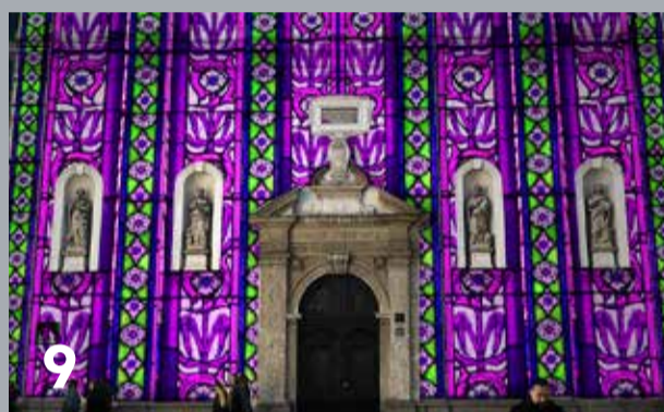
9 Crkva sv. Katarine / St. Catherine's Church Vitracji crkve sv. Katarine / Stained-Glass Windows of St. Catherine's Church

Vodeni svijet kroz 3D mapping i hologramsku projekciju. / Water world through 3D mapping and holographic projection.