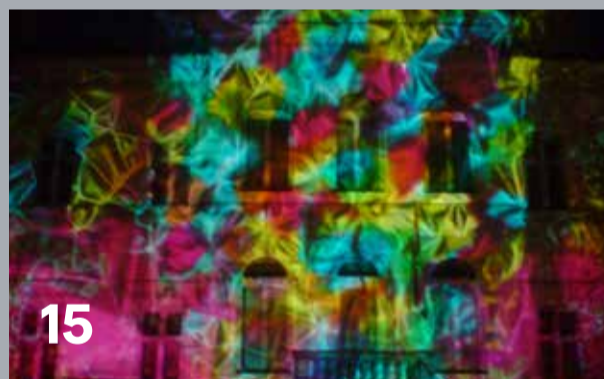
15 Hrvatski institut za povijest / Croatian Institute of History Metamorfoza / Metamorphosis

U trajnoj mijeni oblici oko nas stalno stvaraju novu stvarnost. / In their continuous change, shapes around us keep creating a new reality.