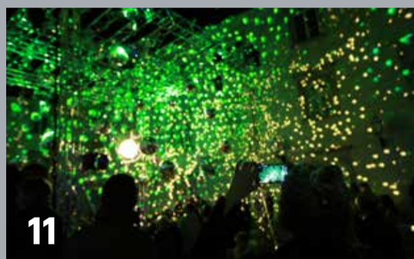
11 Galerija Klovićevi dvori – atrij / Klovićevi Dvori Gallery – Atrium Luster u galeriji / Chandelier in the Gallery

Ljubav prikazana kroz dječju igru proricanja voli me ne voli me. / Love shown through the children's foretelling game of Loves Me Loves Me Not.