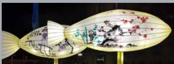
Park Grič / Grič Park Heading to Better*