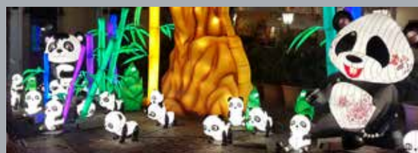
Ljetno kino Gradec / Gradec Summer Cinema Panda Land*