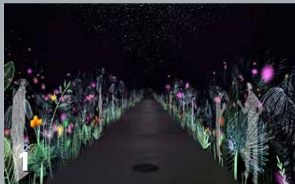
1 Tunel Grič / Grič Tunnel Čarobna šuma / Magic Forest

Tunel ispod Zagreba postaje slikarsko platno transformirano u čaroban šumski svijet u kojem žive neobične životinje i rastu svjetleće biljke. / The tunnel under Zagreb becomes an art canvas transformed into a magical forest world where unusual animals live and luminous plants grow.