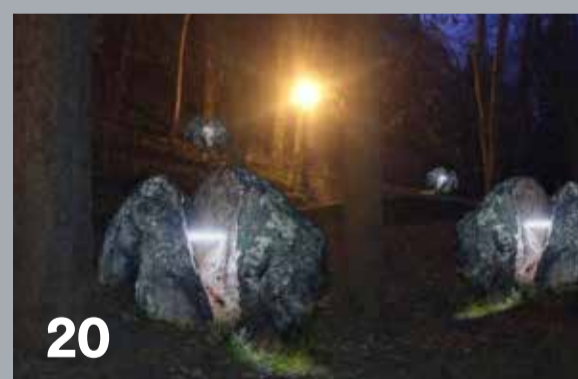
20 Tuškanac (Dubravkin put) Meteoriti / Meteorites

Ples s laserima / Dance with lasers 18:45, 19:30, 20:15, 21:00, 21:45, 22:30