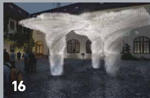
16 Muzej grada Zagreba – veliko dvorište / Zagreb City Museum – main courtyard Oblak pergola / Matematizirani oblak / Cloud Pergola / Mathematized Cloud

U trajnoj mijeni oblici oko nas stalno stvaraju novu stvarnost. / In their continuous change, shapes around us keep creating a new reality.