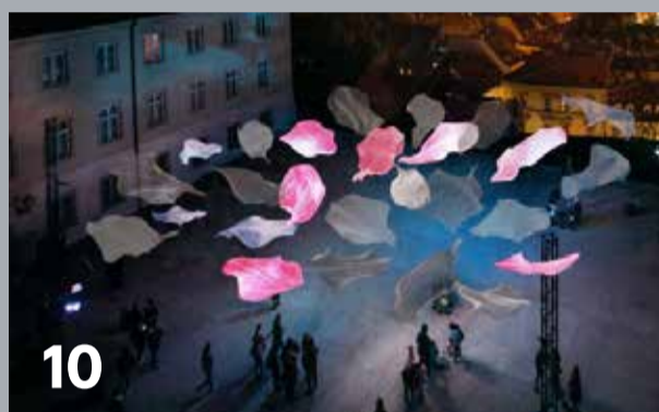
10 Plato Gradec / Gradec Plateau Voli me ne voli me / Loves Me Loves Me Not

Kroz elemente vitracija rasvjetlit će se sva ljepota ove barokne crkve. / The beauty of this Baroque church will be illuminated through the elements of stained-glass windows.