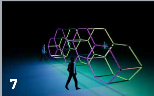
7 Vrancijska poljana / Vranczyany Plateau Saće / Honeycomb

Neka bolji pobijedi! / Let the best one win!