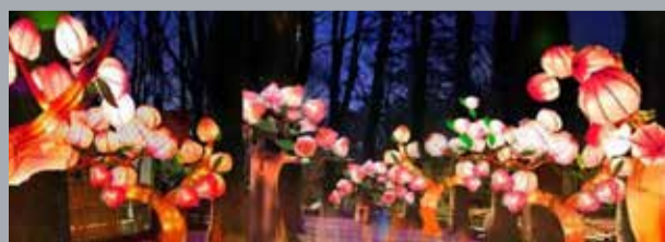
Strossmayerovo šetalište zapad / Strossmayer Promenade west Peach Blossom Source*