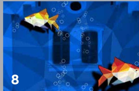
8 Park Grič / Grič Park Akvarij / Aquarium

Svjetlosna 4D instalacija u obliku saća kao simbol proljetnog buđenja. / Honeycomb-shaped 4D light installation as a symbol of spring awakening.